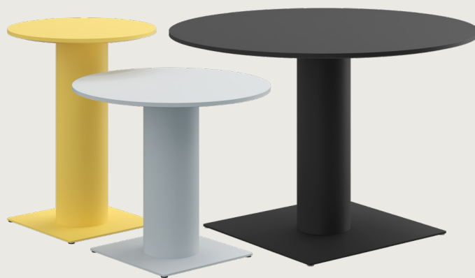
CIAO Table Design: Gunilla Allard, 2013