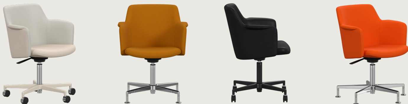
CAROUSEL Armchair Design: Gunilla Allard, 2018