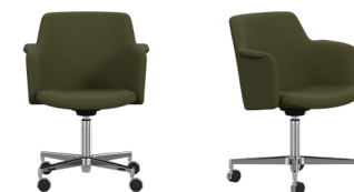
ARMCHAIR 5-FEET WITH CASTORS