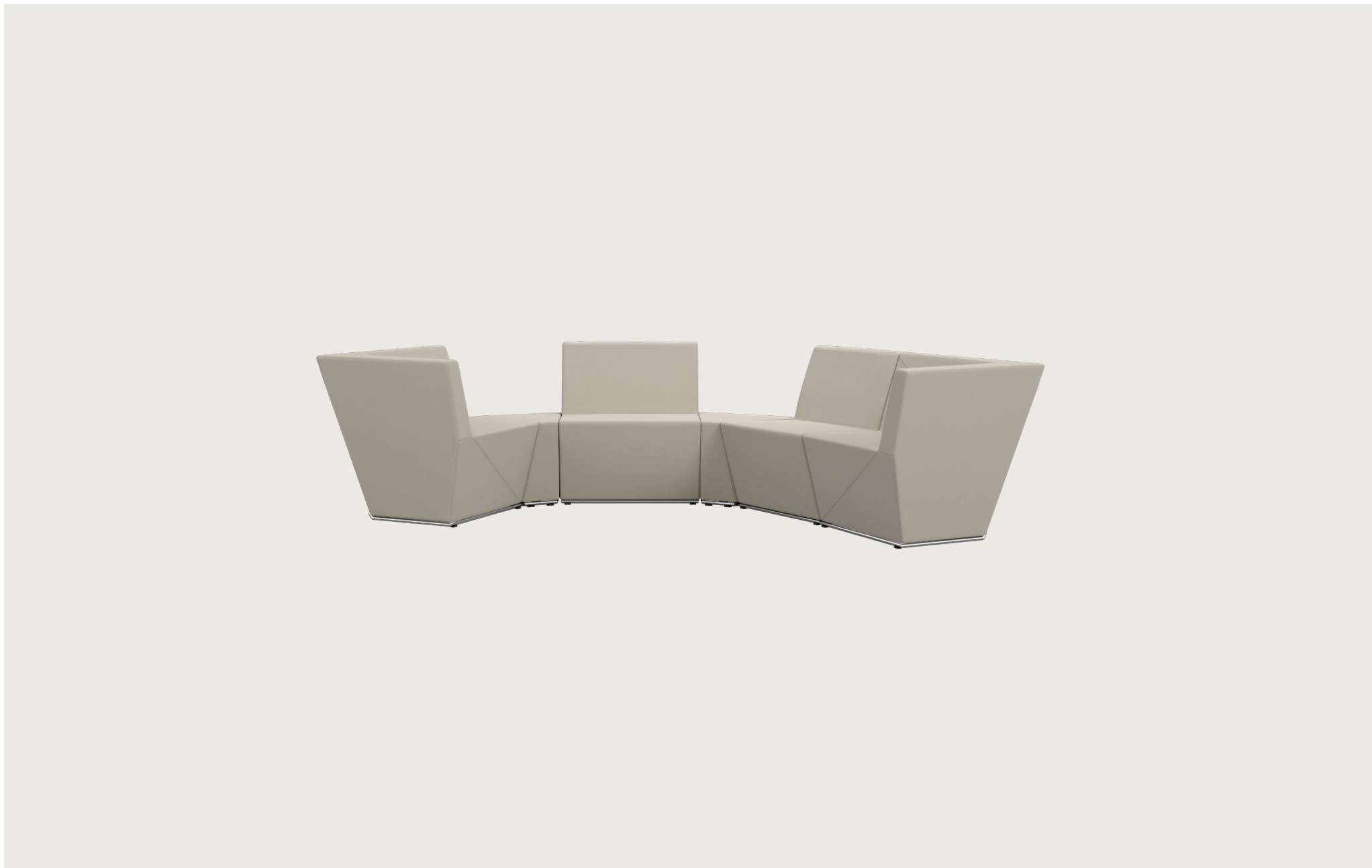
AREA Modular seating Design: Anya Sebton, 2009