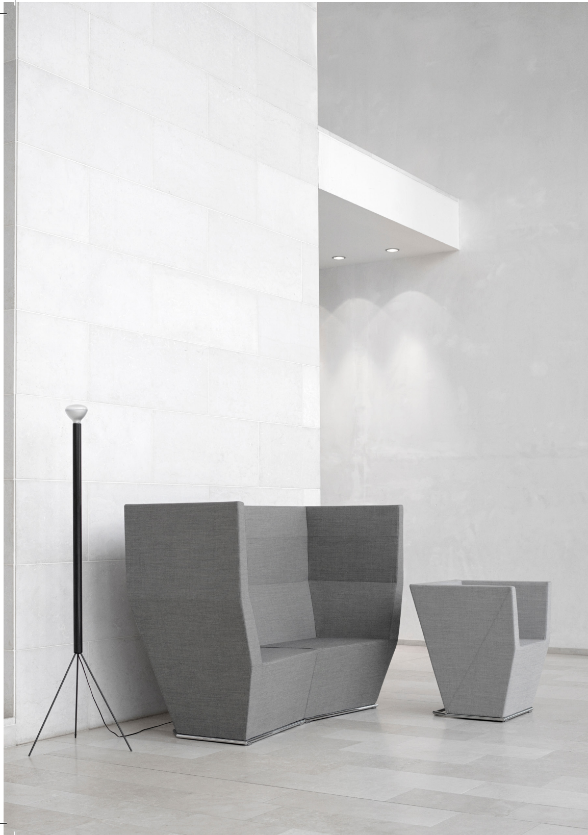
CENTER UNIT LOW BACK