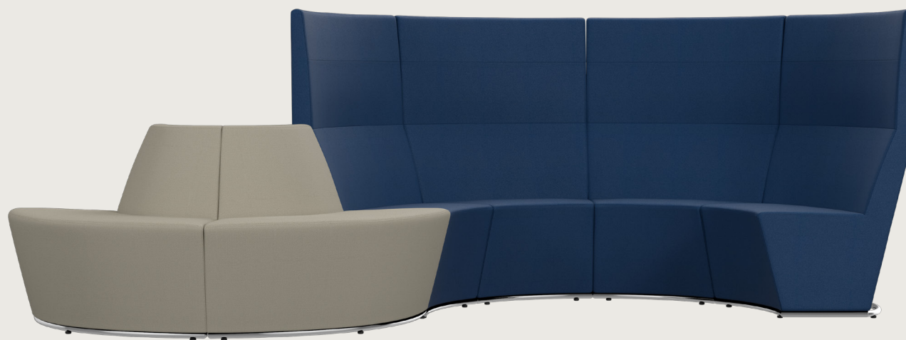
AREA RADIUS Modular seating Design: Anya Sebton, 2016