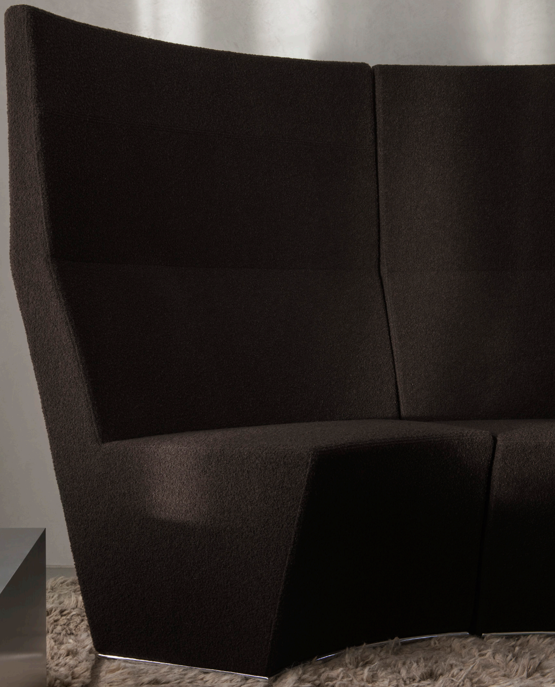
LOW MODULE CLOSED