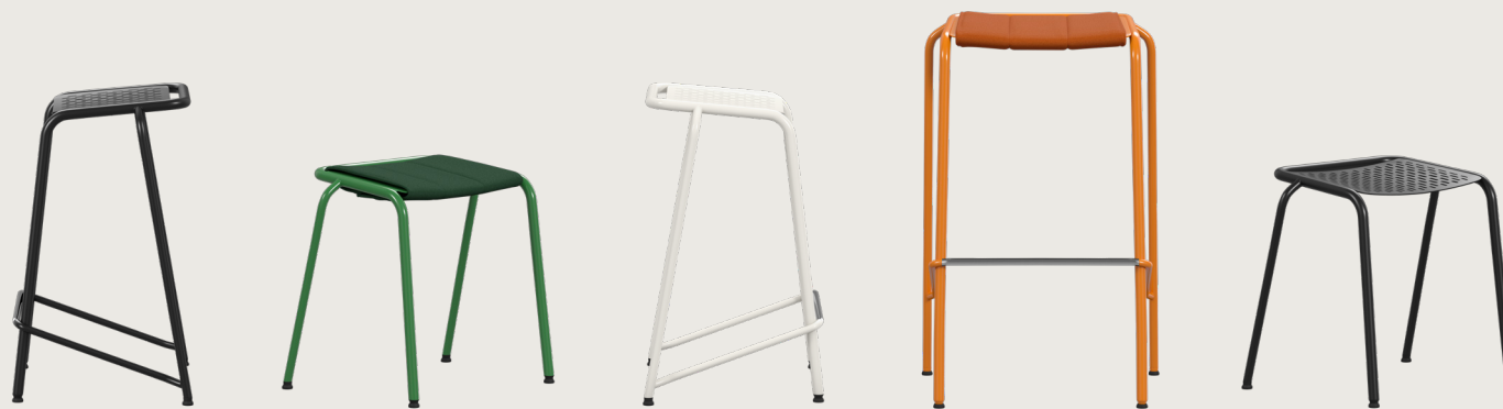
A22 Stool / Barstool Design: Anya Sebtov, 2022